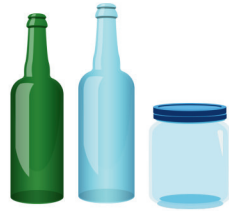
glass bottles & jars