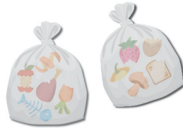
bagged food waste/scrap