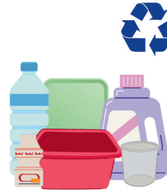
plastic jars, bottles, tubs & trays #1-#7