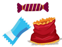
snack & candy wrappers & chip bags