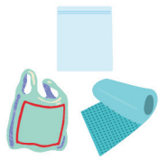
plastic bags, film, bubble wrap, zip top bags, plastic packaging