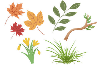
loose yard trimmings