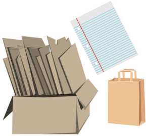
school paper, cardboard, & brown paper bags

Make sure your recyclables are clean, dry, and empty. Recyclables go to the Victor Valley Materials Recovery Facility (MRF) to be recycled into new items! NO plastic bags or plastic film in the recycle cart.