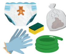
diapers, pet waste, gloves, sponges, & hoses