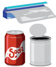
tin & aluminum cans and foil