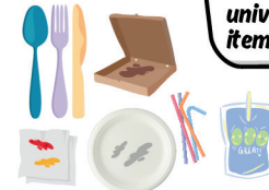
plastic cutlery, paper plates, pizza boxes, napkins/tissues, & straws

Check the flip side for what to do with hazardous or universal waste & bulky items!