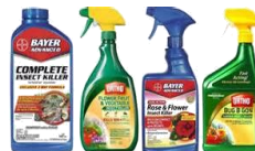
Pesticides, fertilizers, pool & other chemicals