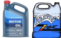
Motor Oil, Oil Filters, Anti-freeze, etc.