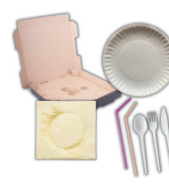
plastic cutlery, paper plates, pizza boxes, napkins, & straws