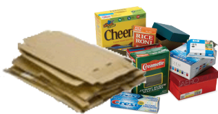
All Kinds of Cardboard