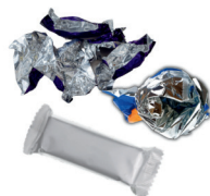
envoltorios de botanas y dulces y bolsas de papas