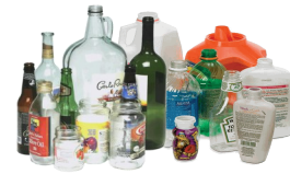
Glass & Plastic Bottles, Jars, Plastic Tubs, and trays (#1-7)