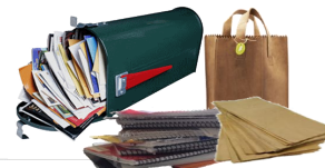
Junk Mail & Clean paper