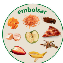
restos de comida en bolsas