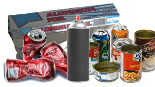
Metal Cans & Empty Aerosol Cans