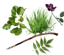
recortes de jardín suelos