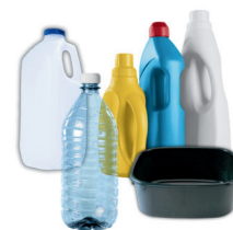
botellas, cubetas, y bandejas de plástico