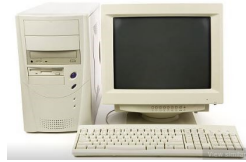
Computers & Monitors