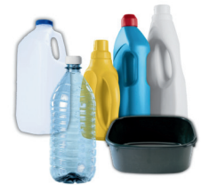
botellas, cubetas, y bandejas de plástico