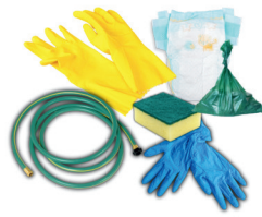
pañales, residuos de mascotas, guantes, esponjas y mangueras