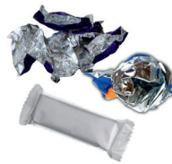
envoltorios de botanas y dulces y bolsas de papas