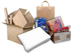
papel de oficina, cartón y bolsas de papel