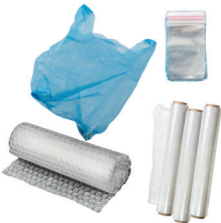
plastic bags, film, & bubble wrap

Place all non-recyclable, non-organic items in the black cart to go to the landfill.