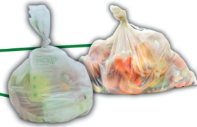
bagged food waste/scraps