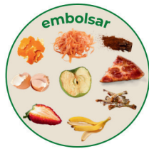
restos de comida en bolsas