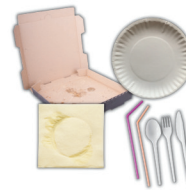
cuchillería de plástico, platos de papel, cajas de pizza, servilletas y pajitas