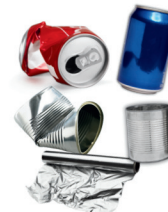
latas y papel de aluminio