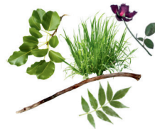
recortes de jardín suelos