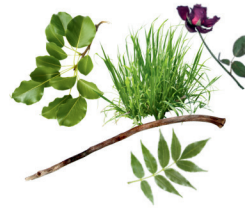
loose yard trimmings