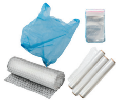
bolsas de plástico, envoltura y plástico de burbujas

Deposite todos los artículos no reciclables ni orgánicos en el carro negro para que vayan al vertedero.