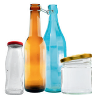
botellas y vasos de vidrio