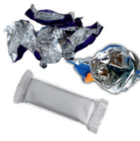
snack and candy wrappers & chip bags