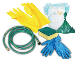
diapers, pet waste, gloves, sponges, & hoses