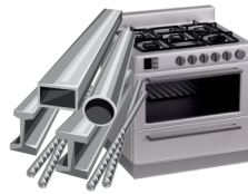
SCRAP METAL & LARGE APPLIANCES