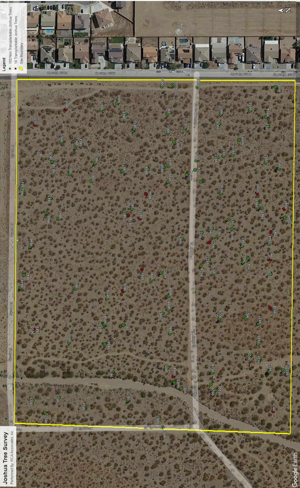
FIGURE 3: LOCATION OF JOSHUA TREES