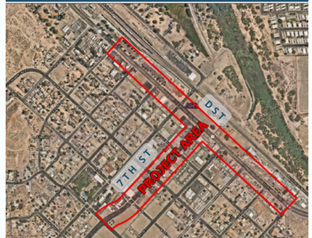
OLD TOWN FACADE IMPROVEMENT PROJECT

This program is in the process of being developed and more information will soon be available. For any questions, please visit VictorvilleCA.gov/OTFacadeProgram